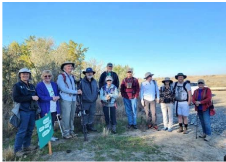
Participants at start of walk.

Fifteen eager hikers met in front of a table, at the start of the Walk, set up by Friends of Mid-Columbia National Wildlife Refuges. The table offered treats and snacks to take on the walk, and a huge jug of ice water, along with the Friends brochure.