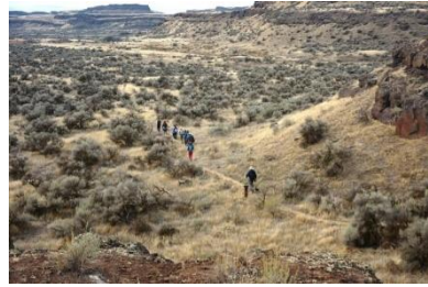
Walking back to the trailhead