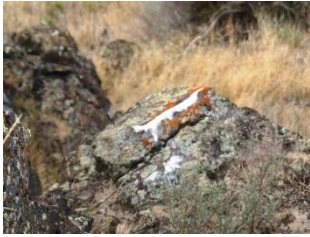
Not a trail marker! Mouse droppings (white) and lichen.

borders surrounding the rectangular white droppings were actually lichens living on the residual nutrients in the mouse droppings.