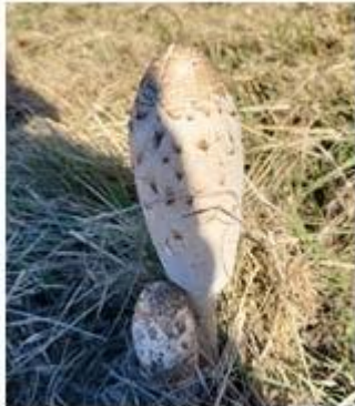
Also seen on the trail... Shaggy Mane.

Other hikers walked the route on other days, and although Friends were not able to count them, we know from the photos submitted to our monthly Photo Gallery, that the loop trail was enjoyed during the week's event.